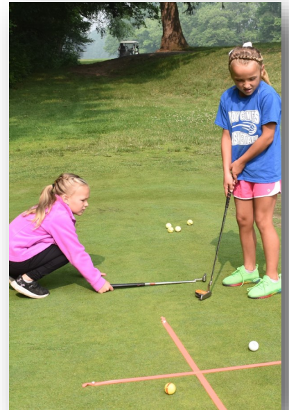
39 Youth participated in the 2023 Junior Golf Program.

TeeSnap has been an integral tool used to increase Dykeman Park Golf Course’s online presence and to create a seamless “check-in” experience for players and employees as well.