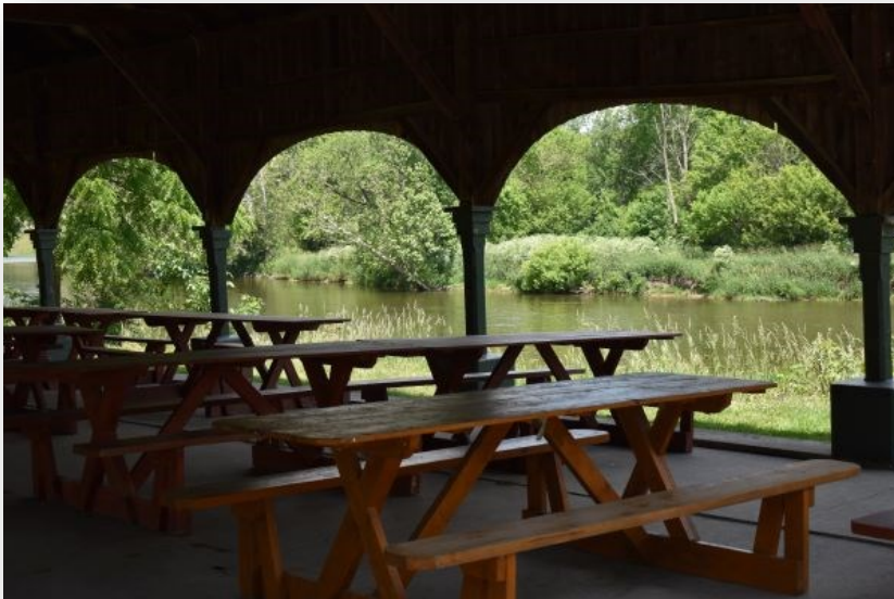
The arches of the Lower Spencer Shelter (as pictured above) are a significant architectural feature of this shelter.

In May 2023, the Logansport Parks Board met to discuss the condition and actions required to be taken at the lower shelter of Spencer Park. It was made known by a report provided by KJG Architecture that snow and wind loads cannot be safely supported by the current structure. The board decided that in order to maintain public safety that the shelter should be closed for public use. Upon the shelter's closure, the board has worked on getting the pavilion stabilized while also keeping the structure as historically accurate as possible. The goal is to have the shelter tentatively back open in the Spring of 2024.